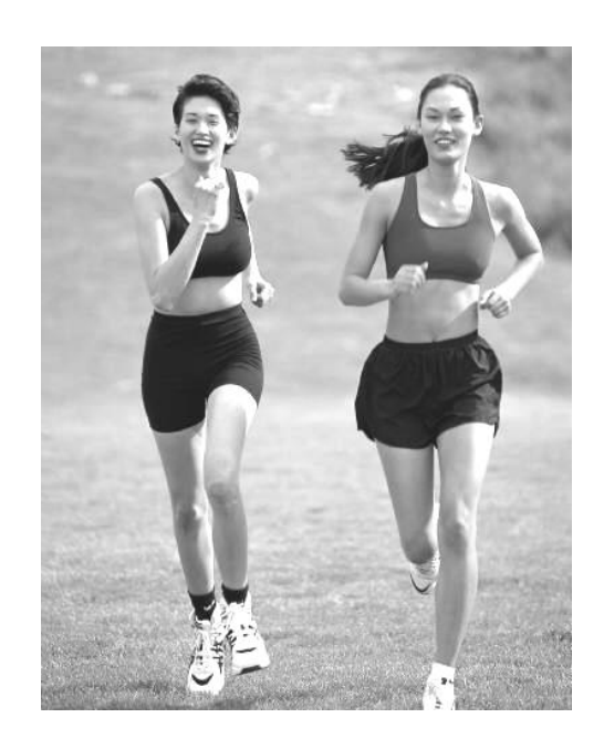
K-12 Health Curriculum